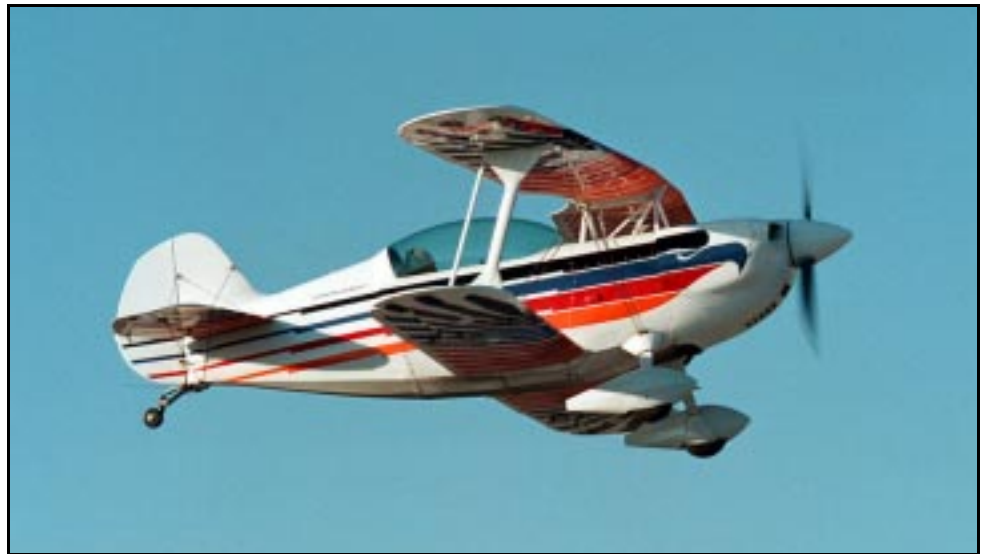
Christen Eagle II shortly after takeoff