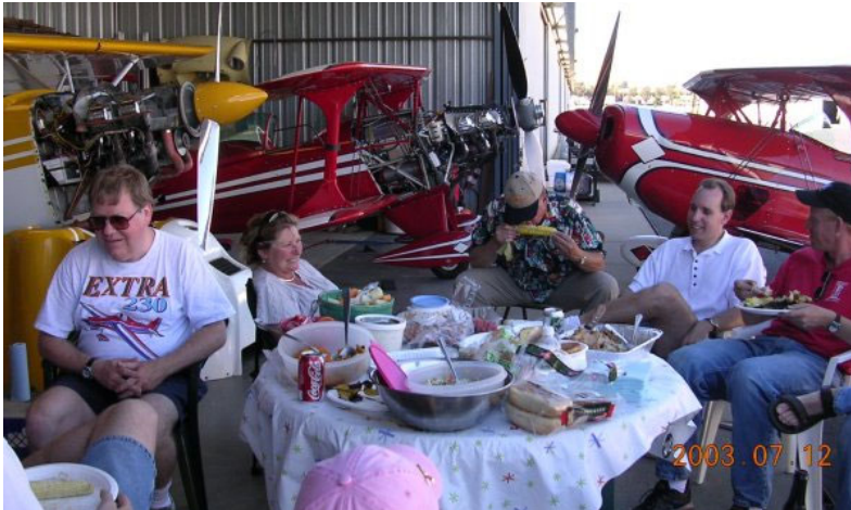
Good chow. Anybody know what happens to corn after you eat it?