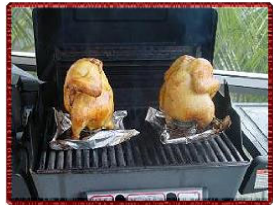
This device was used to cook very mean bird at the Post Paso Party.

More info on this device on: www.beercan chickenroaster.com