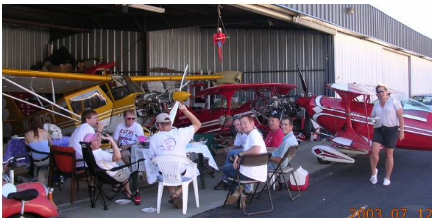
Brad Bird Man