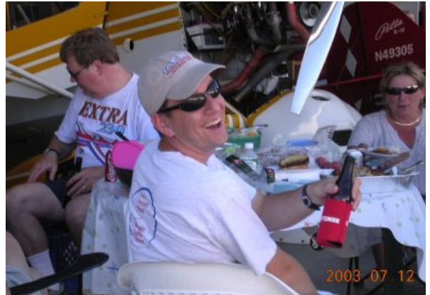
Working on number 4,5,6... 12???